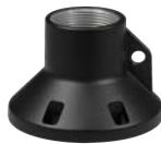
WV-QCL101-B Mount Bracket