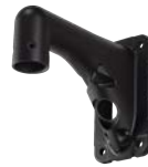
WV-QWL501-B Mount Bracket