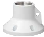
WV-QCL101-W Mount Bracket