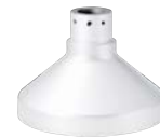
WV-QSR501-W Mount Bracket