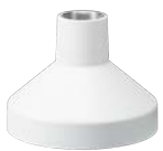
WV-QSR501F-W Mount Bracket