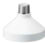
WV-QSR501M-W Mount Bracket