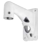
WV-QWL501-W Mount Bracket