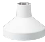
WV-QSR501F1-W Mount Bracket