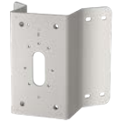
WV-Q183 Mount Bracket