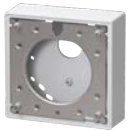
WV-QJB500-W Mount Bracket