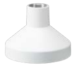
WV-QSR501F1-W Mount Bracket